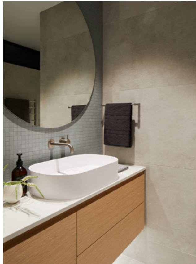
TOP LEFT White Maps tiles from European Ceramics line the walls in the downstairs bathroom, which has a chic recessed shelf above the Justina freestanding bath from Stonebath. The stool is from Soren Liv. TOP RIGHT & ABOVE LEFT The walls in the master bedroom are painted in Resene Half Atmosphere. The simple styling in this space includes an Isabella chair by Simon James and a Bjorn Oval mirror by Middle of Nowhere. ABOVE RIGHT The boys' ensuite features Cinca mosaic tiles from Artedomus, and a vanity custom-made with a S3 stone basin from Stonebath, a Caesarstone Fresh Concrete top and Laminex Sabia Rigato timber veneer panels.